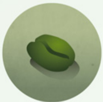
CHEAP GREEN COFFEE BEANS