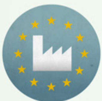
MASS ROASTED ABROAD